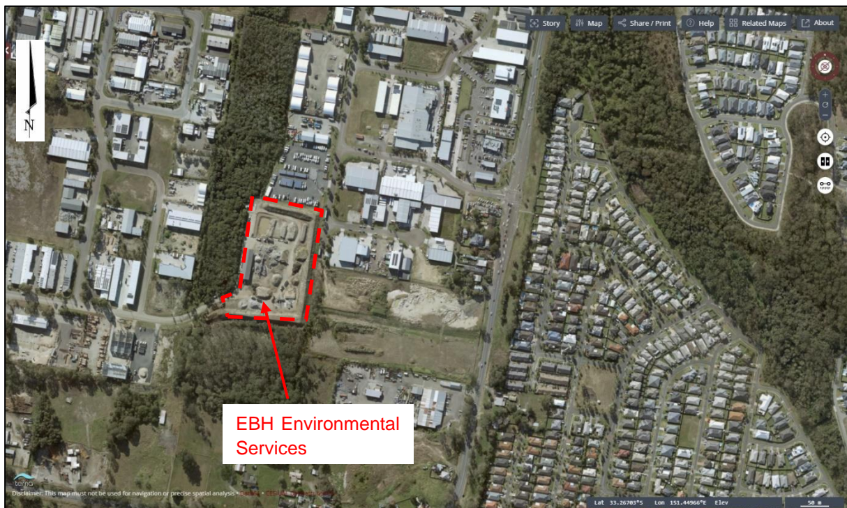
Figure 1 – Site Locality (sourced from Metro Maps Photomaps, dated 25 June 2022)

EBH Environmental Services (EBH) facility is located at 60 Donaldson Street, Wyong (refer Figure 1).